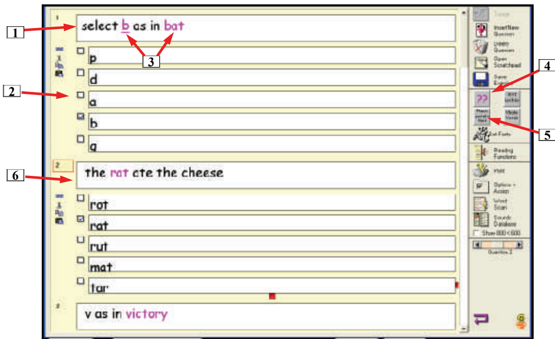
Reading Test Tutor Screen

The screen below is the one the Tutor uses to create the test.